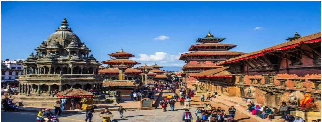
Bhaktapur Ancient Temples

Upon arrival in Kathmandu , you will be greeted by our local representative at the Tribhuvan International Airport (KTM), and then transfer to your hotel to check-in. Afterwards, we will have a brief discussion session regarding the trip. In the evening, you can take a stroll around the streets of Thamel, the biggest tourist hub in Kathmandu with its lively lifestyle filled with shops, restaurants, hotels, bookshops, pubs, etc. Overnight at the hotel.