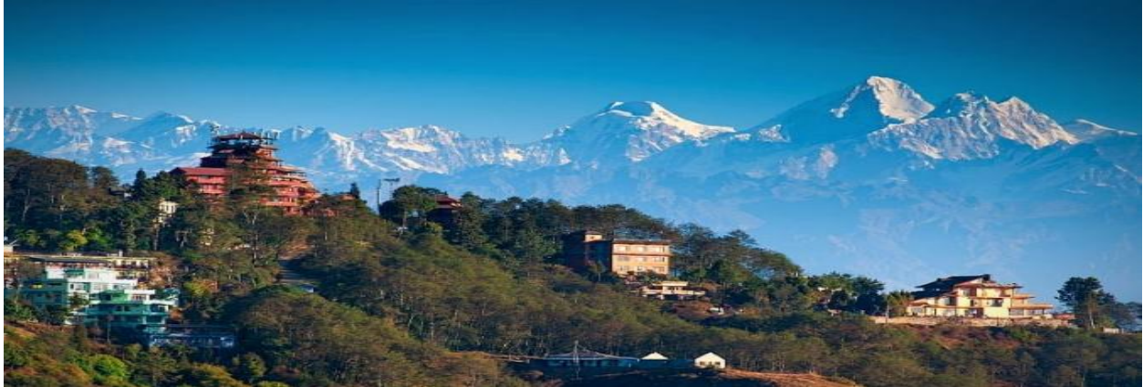
Views of the Himalayas from Nagarkot

Drive to Bhaktapur and explore Bhaktapur Durbar Square and its surroundings. Bhaktapur Durbar Square is an open museum of medieval art and architecture with many specimens of sculpture, woodcarving, and huge pagoda temples dedicated to many gods and goddesses. The square is one of the valley's most stunning architectural showpieces, highlighting Nepal's old art. 55 Window Palace, Ancient Lions Gate, The Big Bell, Golden Gate, Pashupatinath Temple, Barking Bell, Yaksheswor Mahadev Temple, Chyasin Mandap, Siddhi Laxmi Temple, and Phase Dega Temple are the notable figures and structures inside this site.