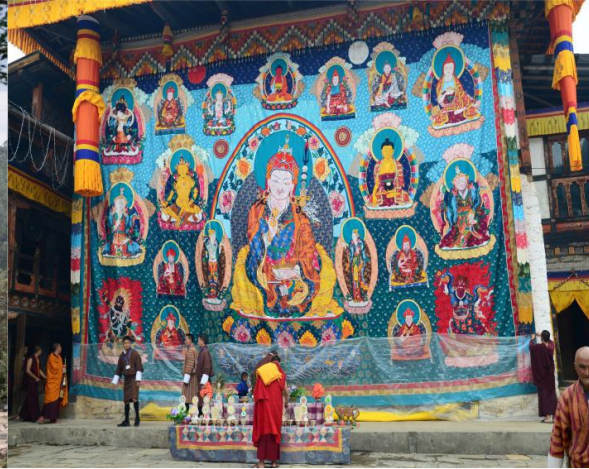
Thangka Display on giant wall of fortress