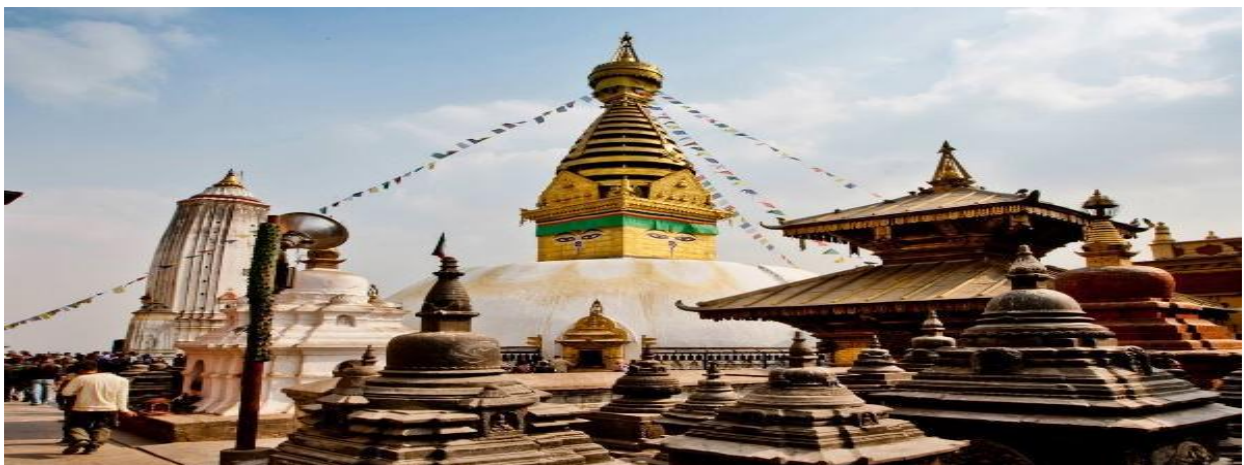
Syambhunath Temple (Monkey Temple)

After exploring these wonders of Kathmandu, drive to Nagarkot , which is one of the nearest places around the Kathmandu valley to see natural beauty of mountains and hills. It is well-known for its sunrise and sunset views and also where people go to unwind. It offers an amazing view of the entire Kathmandu valley and the Himalayan ranges such as the Annapurna, Manaslu, Ganesh Himalaya, Langtang, Jugal, Rolwaling, and Mahalangur (Everest range). If time allows, you will get to enjoy a wonderful sunset view. Overnight at the hotel.