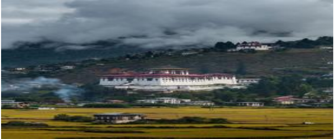
Paro Rinpong Dzong