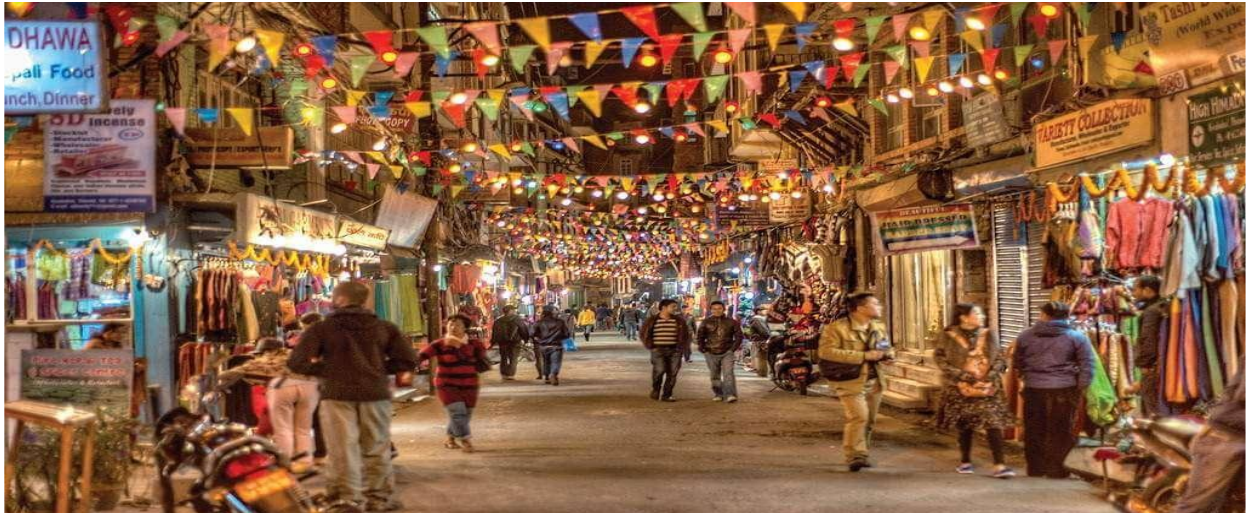
Souvenir shopping at Thamel

Upon arrival in Kathmandu , you will be greeted by our local representative at the Tribhuvan International Airport (KTM), and then transfer to your hotel to check-in. Afterwards, we will have a brief discussion session regarding the trip. In the evening, you can take a stroll around the streets of Thamel, the biggest tourist hub in Kathmandu with its lively lifestyle filled with shops, restaurants, hotels, bookshops, pubs, etc. Overnight at the hotel.