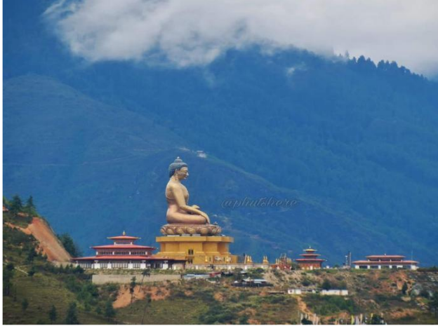
Buddha Dordenma (Buddha Point)