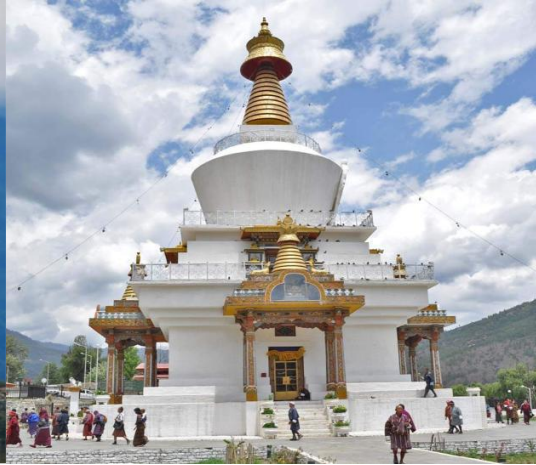
Memorial Chorten (Stupa)