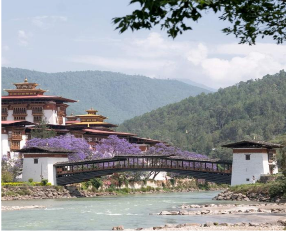
Punakha Dzong Huge